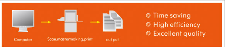
© It takes two procedures, and the operator only needs to practice distant controls on the panel.