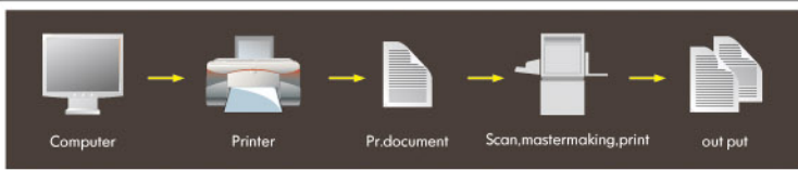
© Traditional way: It takes 4 hours and need participation of the operator